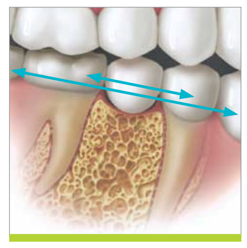
If either anchor tooth is lost, another healthy tooth must be ground down and a longer bridge put into place.