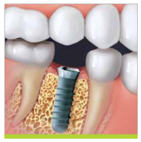
After the implant is placed, bone will grow and integrate onto the surface to hold it securely.