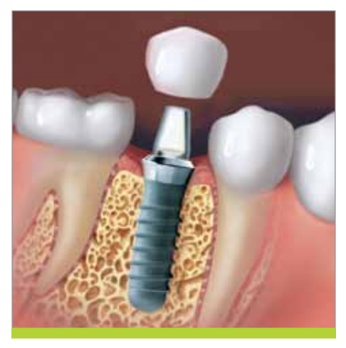
A metal abutment connects the implant to a final crown that matches your natural teeth.